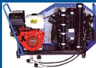
Small engine compressor