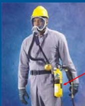
Airline respirator with emergency escape cylinder

Airline respirators need a small escape bottle of air attached at the waist.