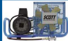
25 Electric high-pressure air compressor