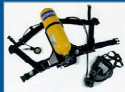
SCBA (self-contained breathing apparatus) – air from a tank