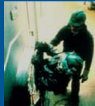
Confined space work