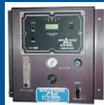
carbon monoxide alarm