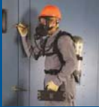
Chemical leak or spill response