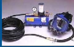
Electric low pressure compressor

Three types of breathing air compressors