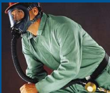
Airline respirator – air from a compressor